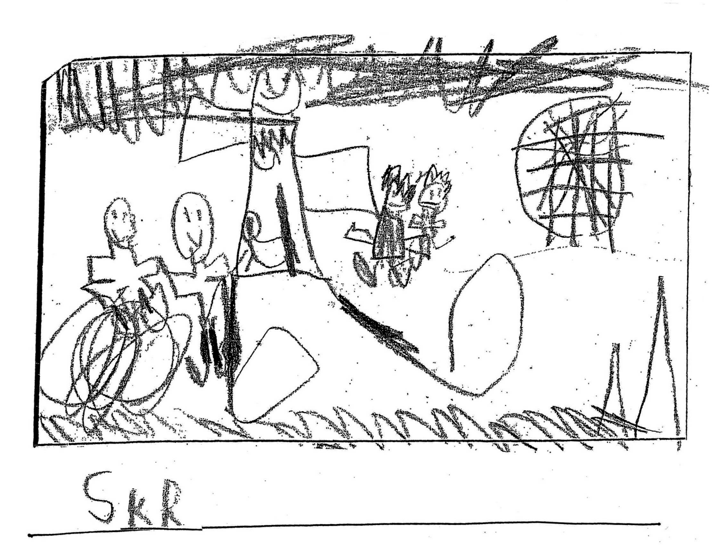
I like soccer.