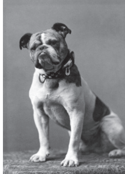
An older kind of bulldog used to fight bulls

Out of all the bulldog types, American, English, and French, in my opinion the English has the best history. In the early 1600s, they were bred to be strong, tough, and fierce. They were used in something called bull-baiting , which is to fight bulls ( www.bulldoginfor.com ). People would watch bulldogs chase bulls around for fun. They would bet on which dog would grab a bull by the nose and push the bull to the ground. Many dogs would die or become seriously hurt at these events because they were stomped on or trampled, or poked by the bulls. Consequently, this became illegal.